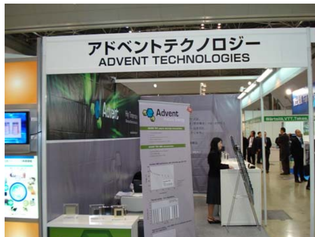
Advent Technologies booth at the 2009 FC Expo

Advent Technologies participated for the first time at the Fuel Cell Expo trade show in Tokyo, Japan. FC Expo is the world’s largest hydrogen and fuel cell event and in combination with PC Expo, Asia’s largest photovoltaic event, they were attended by a record number of 63590 visitors. Advent Technologies were amongst the 925 exhibitors during the three days period of the show.